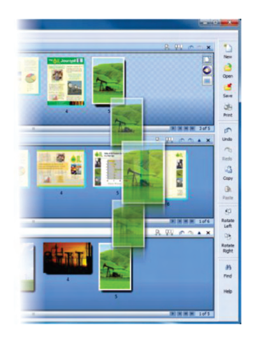
With a simple drag-and drop, you can bring together content from a variety of sources.

Quickly assemble content: With a simple drag-and-drop, you can extract a page from a document, data from a spreadsheet, a slide from a presentation, images — files from a wide variety of formats — to create a single, concise document tailored to your audience.